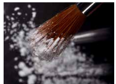
Fig. 15: CLF powder was sprinkled on top before the first firing.

In this case, the wash fire (first firing) was done with Initial Lustre Pastes (Figure 14). In this case, I preferred to use Lustre Pastes rather than LiSi powders because of the particular