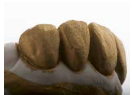
Fig. 21 a-b-c): the surface texture accentuated with gold powder.