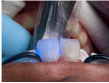
Fig. 24: Tack-curing the luting composite resin for easy excess removal

both central incisors were cemented using a dual-cure resin cement, shade A2 (Figure 23). After placement, the cement was tack-cured for 2-5 seconds and excess of cement was removed. After light-curing (Figure 24) they were left to chemically cure for 2-4 minutes. That procedure was repeated for the lateral incisors and the canines.