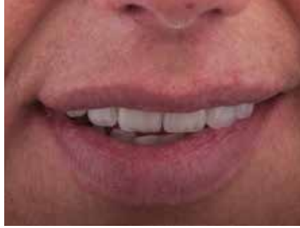
Fig. 25 – 28: Final result, looking very natural and matching the patient's features.

The patient was very happy with the aesthetics of her teeth and she felt she could smile with confidence again (Figures 25-28). Careful planning and good communication between patient, dentist and dental technician are key in obtaining a satisfactory result.