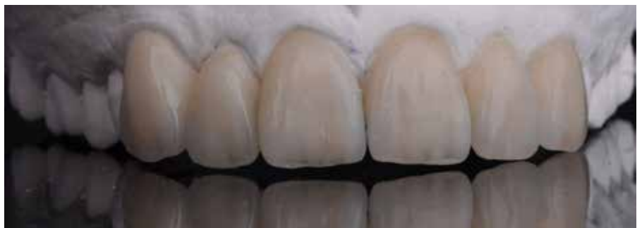
Fig. 22: Restorations after the shape fire on the master model.