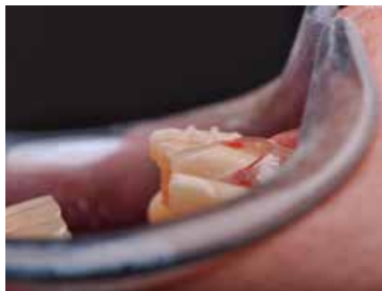
Fig. 7: Lateral view showing the emergence profile and the equigingival margin

Teeth were prepared through the mock-up. A mock-up serves as an excellent indicator of the amount of tooth tissue that needs to be removed in each area to obtain the correct restoration thickness. Orientation grooves were prepared to guide the depth (Figure 4-7). The margins were placed equigingivally in order not to violate the biological width and unsupported enamel was removed (Figure 8).