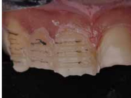
Fig. 5: Vestibular reduction