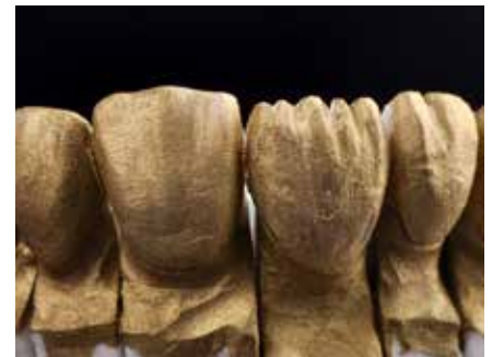
Fig. 13: Cutback with gold powder showing the surface texture