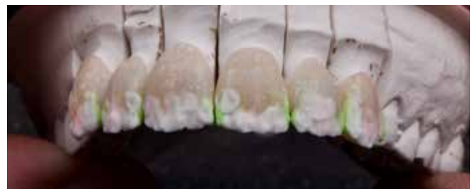
Fig. 18: The mamelons are covered with CLF powder. This wrapping of the enamel with CLF ensures an optimal light transmission and creates a natural halo effect.