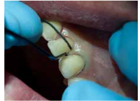
Fig. 8: Placement of retraction cords. Note that all margins were placed equigingivally.

With the LiSi system, a very natural emergence profile and a perfect transition from the gingiva to the crown can be obtained while respecting the biological width. The use of porcelain-fused-to-metal and even zirconia frameworks often create a shadow zone at the gingival margin, right below the cervical margin of the tooth due to a lack of fluorescence of that part. The Initial LiSi Press framework distributes the light in a more natural way. Due to the HDM technology, the microcrystals are very evenly dispersed in the LiSi Press ingots and this effect remains after pressing. In the past, a dentist would have had the tendency to make the preparation deeper to avoid this