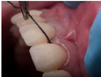
Fig. 10: Removal of retraction cords

After the preparation of the cutback with diamond burs, the structure was gently sandblasted with 25-50 µm Al 2 O 3 at a maximum pressure of 1.5 bar.