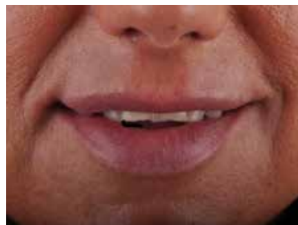
Fig. 1b: Mouth in rest