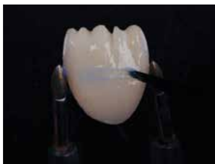
Fig. 14: Initial Lustre Pastes were chosen for the connection between the cutback ingot and the veneering ceramic. Alternatively, Initial LiSi powders can be used.