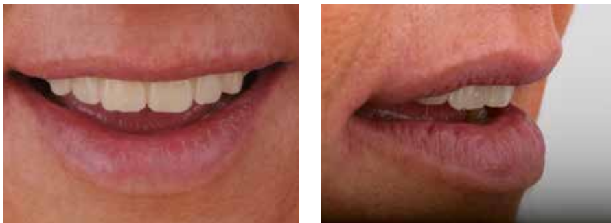
Fig. 2: Intraoral mock-up. a) frontal view; b) lateral view

also evaluated in this stadium. On the other hand, they can express the changes they wish to see in more detail. A careful treatment planning is the best guarantee to keep your patient satisfied in the long term.