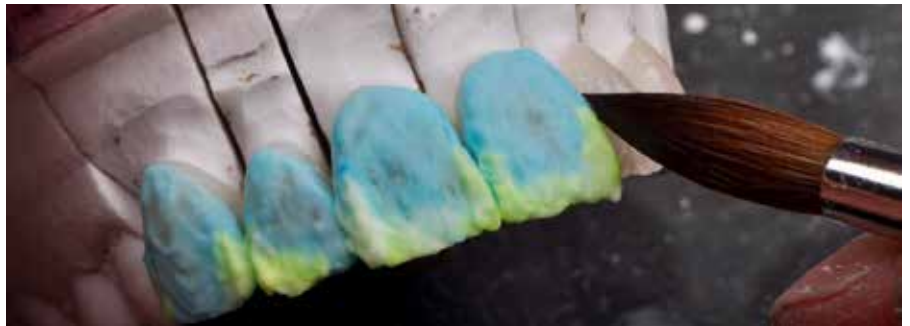
Fig. 20: Build-up of the enamel layers. Blue: enamel mixed with 20% of Opal Booster; Green: pure Opal Booster.

After removal of the temporary veneers, the teeth were cleaned with polishing paste. The intaglio surface of the restoration was etched with hydro-fluoric acid gel under microscope magnification. After rinsing, the restorations were primed and air-dried. In the mouth, the lateral incisors were isolated with Teflon and