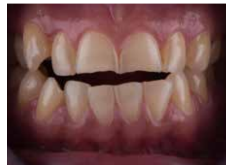
Fig. 1c: Vertical reduction of the frontal teeth by severe erosion.