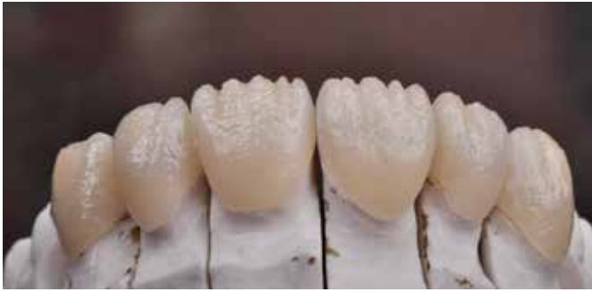
Fig. 16: Result after the wash fire.

Starting from the wash fire (Figure 16), the mamelons will be adapted so that the horizontal line is visually broken and more depth can be added to the incisal zone.