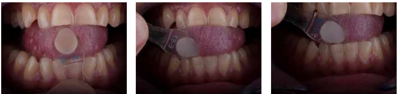
Fig. 3 a-c: Shade determination. It is important to keep the key in the same angulation as the tooth to have a similar light reflection. The shades are determined in daylight or lamps of similar intensity. The two enamel shades that most closely matched the teeth, were selected.

CLF has to come from incisally and the corner of the incisal edge should be trimmed in a 45° angle. The most difficult part in the shade determination process is to select the correct value. This is strongly linked with the manipulation of the enamel layers.