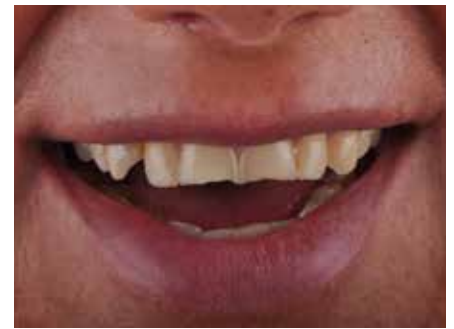
Fig. 1a: Patient's smile

A 40-year-old female patient who was unhappy with the appearance of her maxillary frontal teeth presented at the dental office. Clinical examination revealed severe erosion of the maxillary anterior teeth with loss of vertical dimension, in a pattern strongly suggestive for erosion by gastric acid (Figure 1). The patient had suffered from bulimia nervosa in the past.