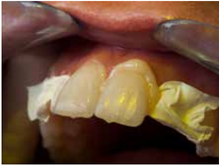
Fig. 23: Seating of the central incisors.