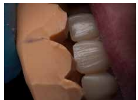
Fig. 9: a) Silicone putty index; b) Transfer to the mouth