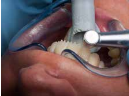
Fig. 4: Incisal reduction