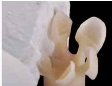
Fig. 12: Divesting of the restorations. There is virtually no reaction layer.