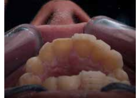
Fig. 6: Incisal view of vestibular reduction

Teeth were prepared through the mock-up. A mock-up serves as an excellent indicator of the amount of tooth tissue that needs to be removed in each area to obtain the correct restoration thickness. Orientation grooves were prepared to guide the depth (Figure 4-7). The margins were placed equigingivally in order not to violate the biological width and unsupported enamel was removed (Figure 8).